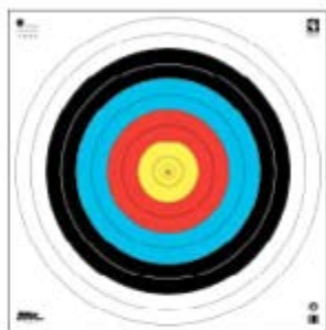
60 cm used in unsighted & sighted divisions